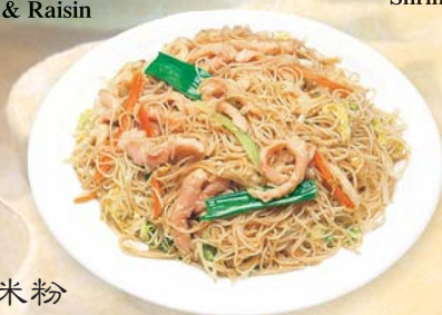
NN 7. 大鵬炒米粉 Stir Fried Rice Noodle w. Diced Seafood