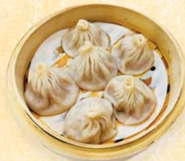
DS15. 蟹粉小籠包 Steamed Crab Meat w. Pork Soup Dumpling (6)