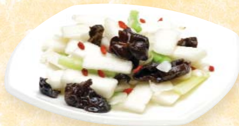
V 6. 雲耳勝瓜炒淮山 Sauteed Black Fungus, Chinese Okra & Common Yam