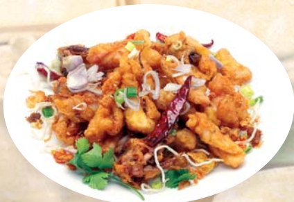
A4. 椒鹽鮮魷 Deep Fried Squid w. Salt & Pepper