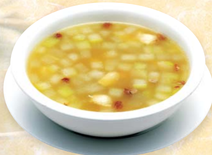
S11. 八寶瓜粒湯 Winter Melon Soup w. Diced Seafood & Meat