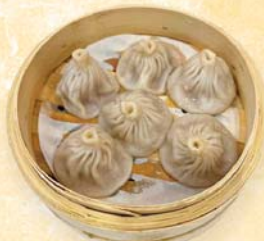
DS14. 豬肉小籠包 Steamed Pork Soup Dumpling (6)