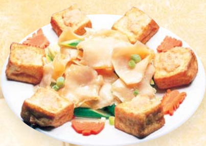
FS 1. 金磚螺片帶子 Sauteed Conch & Scallop w. Fried Tofu