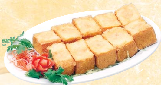
V 1. 脆皮炸豆腐 Crispy Fried Stuffed Bean Curd