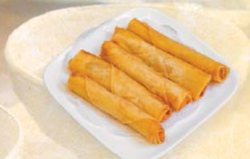
DS22. 炸蝦條 Deep Fried Shrimp Roll (5 Rolls)