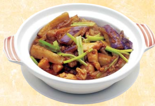
C 7. 咸魚雞粒茄子煲 Diced Chicken & Salty Fish w. Eggplant in Casserole