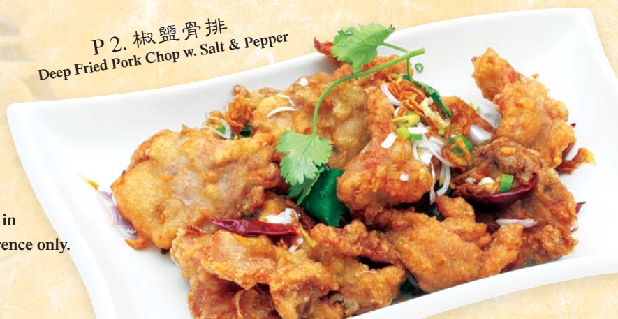
P 2. 椒鹽骨排 Deep Fried Pork Chop w. Salt & Pepper

Before placing your order, please inform your server if a person in your party has a food allergy. Pictures in this menu are for reference only. 圖片只供參考, 一切以食物為準