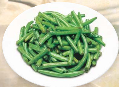
V 9. 干扁四季豆 Sauteed String Bean