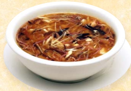
S13. 酸辣湯 Hot and Sour Soup

Before placing your order, please inform your server if a person in your party has a food allergy Pictures in this menu are for reference only. 圖片只供參考, 一切以食物為準