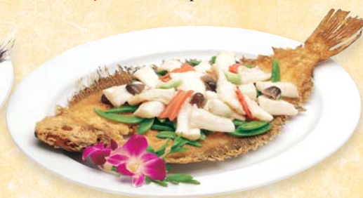
FS 12. 骨香龍利球 Sauteed Flounder Fillet w. Vegetable on Crispy Fish Bone

Before placing your order, please inform your server if a person in your party has a food allergy Pictures in this menu are for reference only. 圖片只供參考, 一切以食物為準