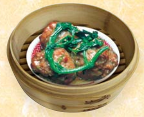
DS16. 牛肉丸 Steamed Beef Balls