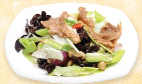
P 7. 荷芹咸肉 Sauteed Salted Pork w. Snow Pea & Celery