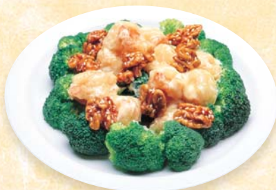
FS 3. 合桃沙汁蝦球 Deep Fried Jumbo Shrimp w. Walnut & Mayonnaise