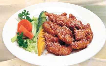
CH 12. 芝麻雞 Sesame Chicken