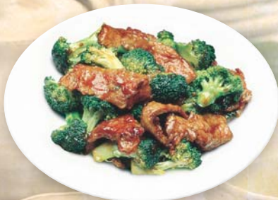
B 8. 西芥蘭牛肉 Stir Fried Sliced Beef with Broccoli