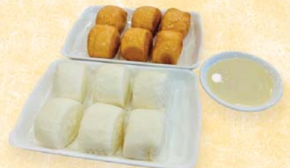
DS20. 迷你饅頭 Mini Plain Bun w. Sweetened Condensed Milk (6 pcs) (Steamed or Deep Fried)