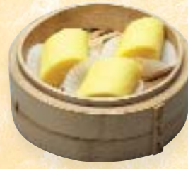
DS11. 香滑馬拉卷 Steamed Egg Cream Roll