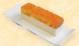
DS24. 木瓜椰汁糕 Papaya Coconut Milk Pudding