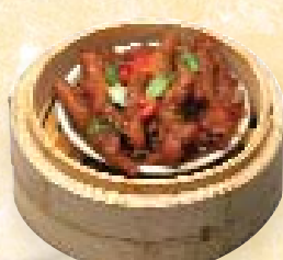
DS6. 豉汁蒸鳳爪 Steamed Chicken Feet w. Black Bean Sc.