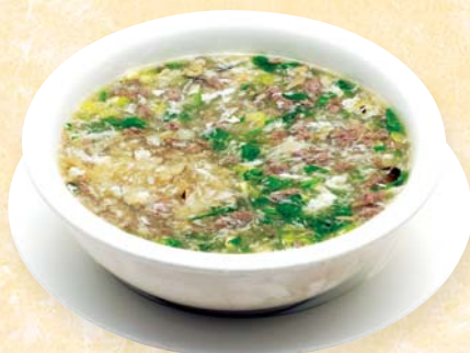
S7. 西湖牛肉羹 Minced Beef Soup w. Egg White & Parsley