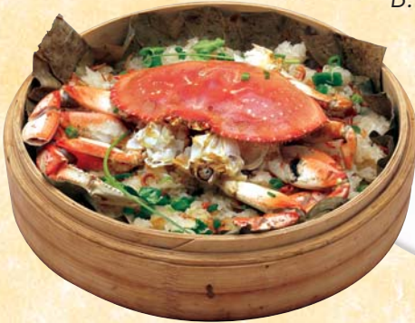
LS 1. 大蟹蒸糯米飯 Steamed Dungeness Crab w. Sticky Rice