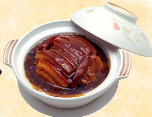
C 10. 梅菜扣肉煲 Braised Pork w. Preserved Vegetable in Casserole

Before placing your order, please inform your server if a person in your party has a food allergy Pictures in this menu are for reference only. 圖片只供參考, 一切以食物為準