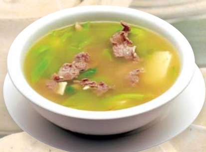
S10. 咸蛋芥菜肉片湯 Sliced Pork w. Mustard Green & Salted Duck Egg Soup