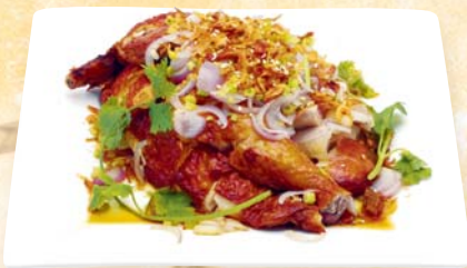
CH 3. 蒜香脆皮雞 Crispy Fried Chicken w. Garlic Soy Sauce