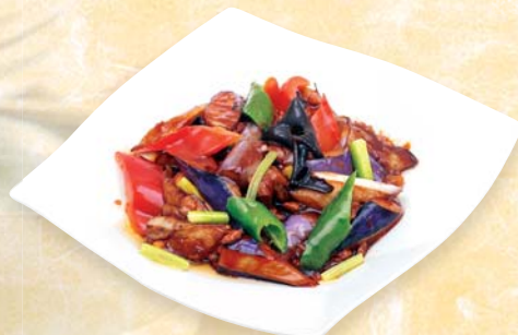
V 10. 魚香茄子 Sauteed Eggplant w. Garlic Sauce