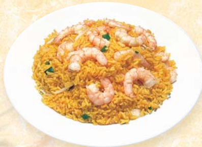
FR 9. 蝦仁炒飯 Shrimp Fried Rice