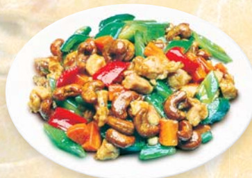
CH 10. 腰果雞丁 Stir Fried Diced Chicken w. Cashew Nut