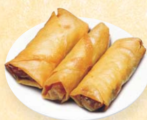
DS3. 春卷 Deep Fried Spring Roll (3 Rolls)