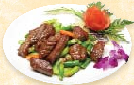
B 3. 蘆筍炒士的球 Stir Fried Steak Cubes w. Asparagus