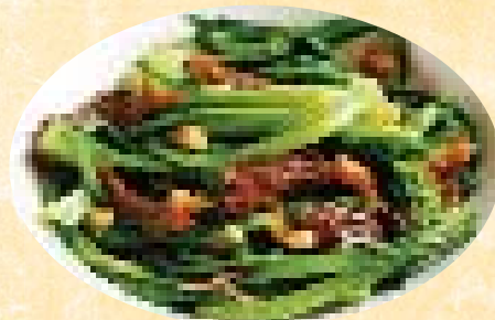
V 14. 豆豉鯪魚炒油麥菜 Sauteed Indian Lettuce w. Canned Fish & Black Bean

Before placing your order, please inform your server if a person in your party has a food allergy Pictures in this menu are for reference only. 圖片只供參考, 一切以食物為準