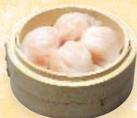
DS1. 水晶鮮蝦餃 Steamed Shrimp Dumpling (4 pcs)