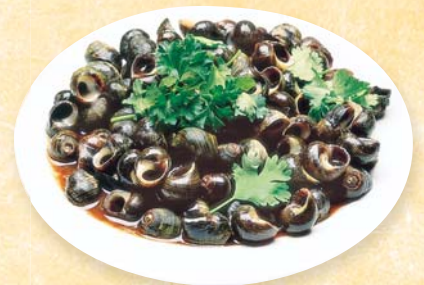
DS9. 魚露石螺 Sauteed Snail w. Fish Sauce

Before placing your order, please inform your server if a person in your party has a food allergy Pictures in this menu are for reference only. 圖片只供參考, 一切以食物為準