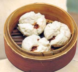
DS9. 蜜汁叉燒飽 Steamed Roasted Pork Bun