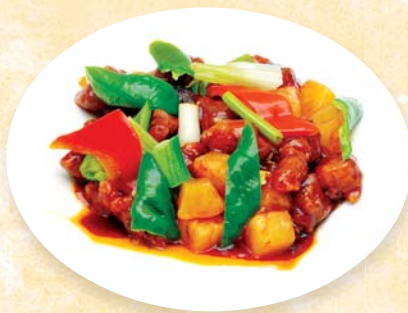
P 3. 菠蘿咕嚕肉 Sweet & Sour Pork