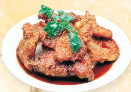
P 1. 京都骨排 Pork Chop Peking Style