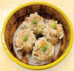
DS13. 雞肉燒賣 Steamed Chicken Dumpling (4)