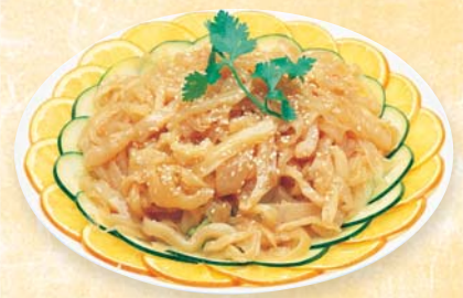
A3. 涼拌海蜆 Jelly Fish w. Sesame Oil