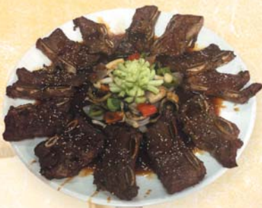
B 2. 燒汁牛仔骨 Pan Fried Beef Short Rib w. Teriyaki Sauce