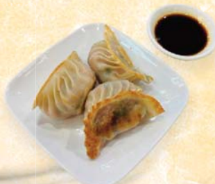
DS18. 菜肉鍋貼 Pan Fried Pork Dumpling (3)