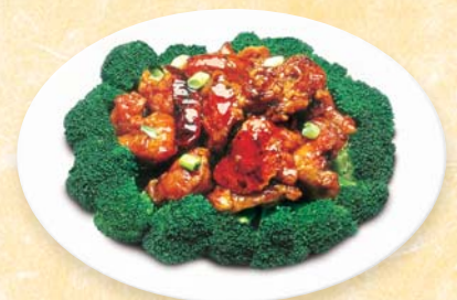
B 13. 陳皮牛 Orange Beef

Before placing your order, please inform your server if a person in your party has a food allergy Pictures in this menu are for reference only. 圖片只供參考, 一切以食物為準