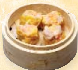
DS2. 鮮蝦燒賣 Steamed Shrimp & Pork Shumai (4 pcs)