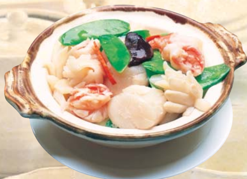
C 8. 海鮮豆腐煲 Assorted Seafood w. Tofu in Casserole