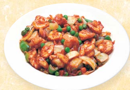
FS 5. 魚香蝦球 Jumbo Shrimp w. Garlic Sauce