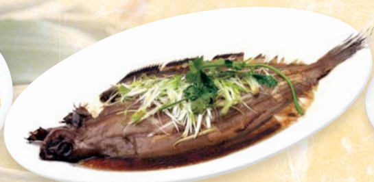
FS 10. 清蒸大龍利 Steamed Flounder w. Ginger & Scallion