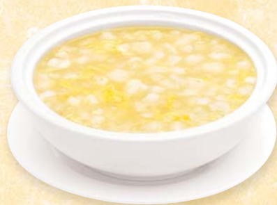
S8. 雞茸粟米羹 Corn Soup w. Minced Chicken