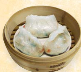
DS7. 潮式蒸粉果 Steamed Chiew-Chow Style Dumpling