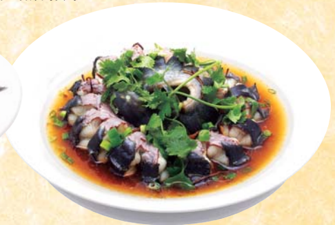
LS 4. 豉汁蒸大鱈 Steamed Eel w. Black Bean Sauce