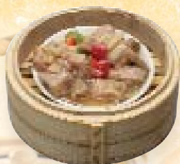
DS5. 豉汁蒸排骨 Steamed Pork Spare Rib