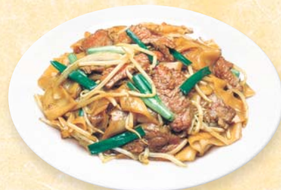
NN 5. 干炒牛河 Beef Chow Fun