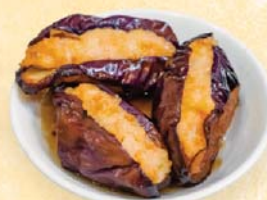
DS23. 煎釀茄子 Pan Fried Stuffed Eggplant (3)