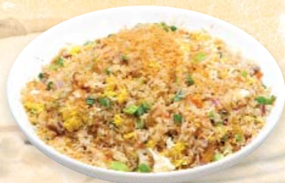
FR 1. 金雙蛋炒飯 House Special Fried Rice w. Dried Shrimp, Egg White, Egg Yolk & Raisin