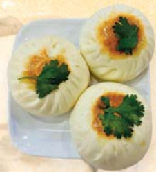
DS17. 生煎菜肉包 Pan Fried Tiny Pork Bun (3)