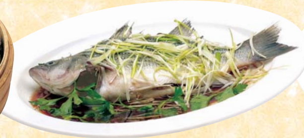
LS 3. 清蒸游水魚 Steamed Fish