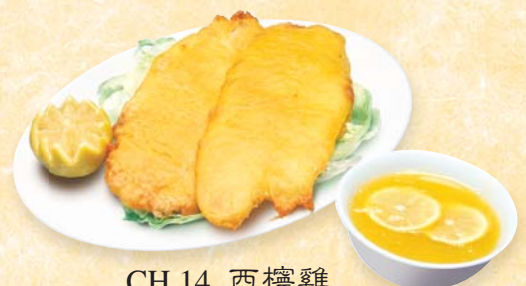
CH 14. 西檸雞 Deep Fried Chicken with Lemon Sauce

Before placing your order, please inform your server if a person in your party has a food allergy Pictures in this menu are for reference only. 圖片只供參考, 一切以食物為準