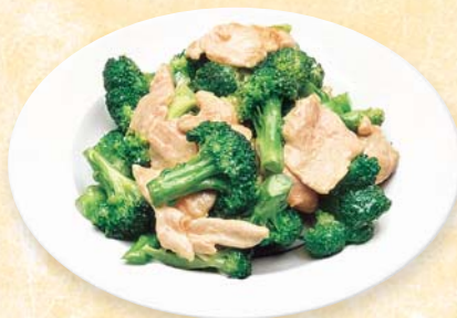
CH 7. 西芥蘭雞片 Sliced Chicken with Broccoli