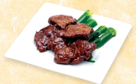
B 6. 玉樹牛柳 Pan Fried Fillet Steak w. Chinese Broccoli