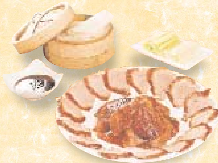
D 1. 北京片皮鴨 Peking Duck

Before placing your order, please inform your server if a person in your party has a food allergy Pictures in this menu are for reference only. 圖片只供參考, 一切以食物為準