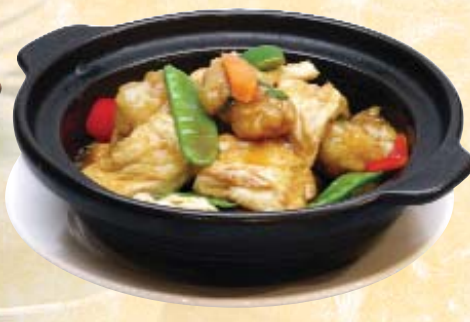
C 9. 豆腐斑腩煲 Braised Fish Fillet w. Tofu in Casserole