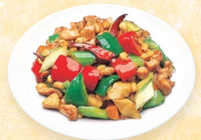
CH 9. 宮保雞丁 Kung Pao Chicken (w. Peanut)