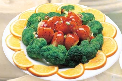
FS 7. 紅燒帶子 Braised Scallop w. Vegetable