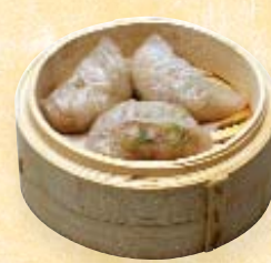
DS8. 香芋餃 Steamed Taro Dumpling