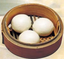
DS10. 金牌流沙飽 Steamed Sweet Creamy Egg Yolk Bun