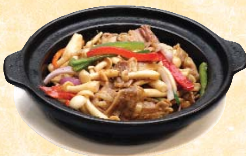
C 4. 沙嗲金蒜肥牛煲 Sliced Fatty Beef w. Enoki Mushroom in Satay Sauce