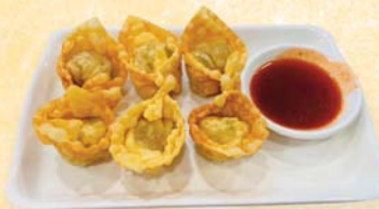
DS19. 脆炸雲吞 Fried Wonton w. Sweet & Sour Sauce (6)