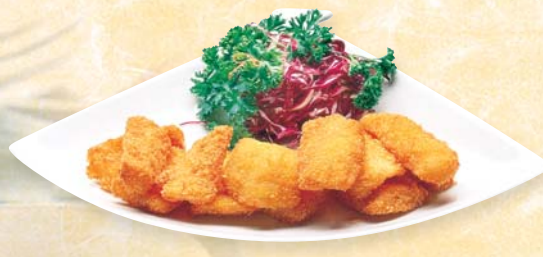
A7. 脆炸鮮奶 Crispy Fried Milkurd (10)