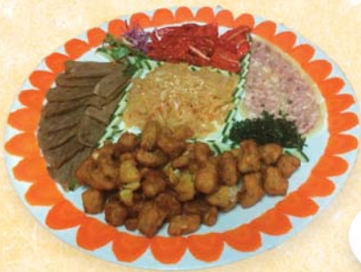
A1. 喜運來大拼盤 Cold Cuts Combination Platter