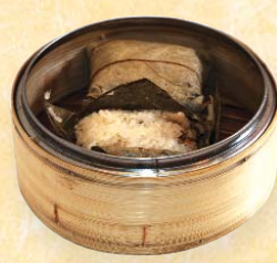
DS12. 珍珠雞 Steamed Sticky Rice in Lotus Leaves

Before placing your order, please inform your server if a person in your party has a food allergy Pictures in this menu are for reference only. 圖片只供參考, 一切以食物為準