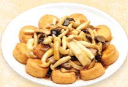
V 4. 鮮什菌扒玉子豆腐 Japanese Style Tofu w. Assorted Mushroom