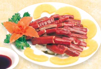
A5. 百花炸釀大腸 Deep Fried Stuffed Pork Intestine