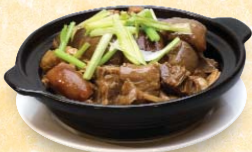
C 2. 枝竹羊腩煲 Braised Lamb w. Dried Tofu in Casserole