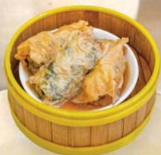
DS21. 蠔皇鮮竹卷 Steamed Bean Curd Sheet Roll w. Pork