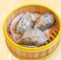
DS4. 素菜餃 Steamed Vegetable Dumpling (3)