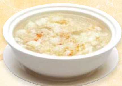
S2. 蟹肉魚肚羹 Fish Maw Soup w. Crab Meat