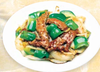
B 12. 青椒牛肉 Stir Fried Sliced Beef w. Pepper & Onion